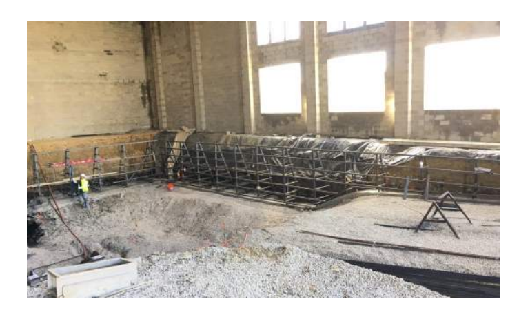
Area C Washington Level Natatorium Construction