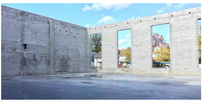
Area C Auxiliary Gym Slab-On-Grade Poured