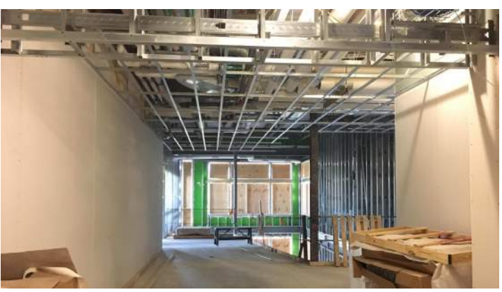
Area A & F Corridor & Atrium Ceilings