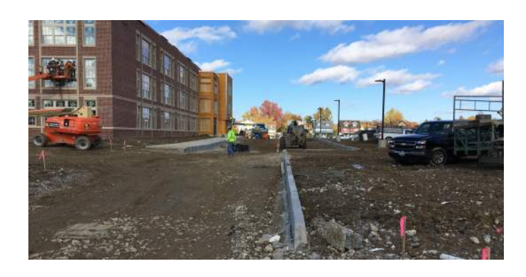
East Drive Curbs & Sidewalks Installations