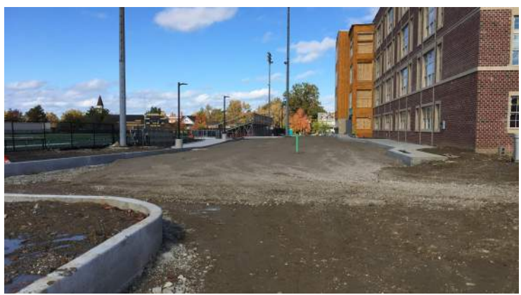
West Drive Prep for Asphalt Pavement