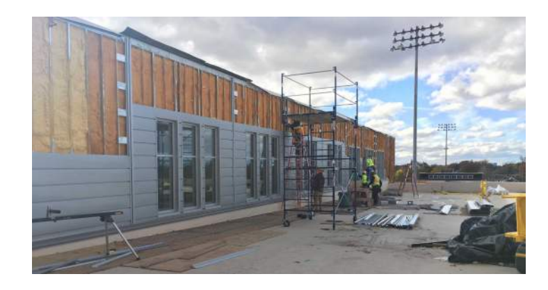
Metal Veneer Panels Area A North Elevation 3rd Floor