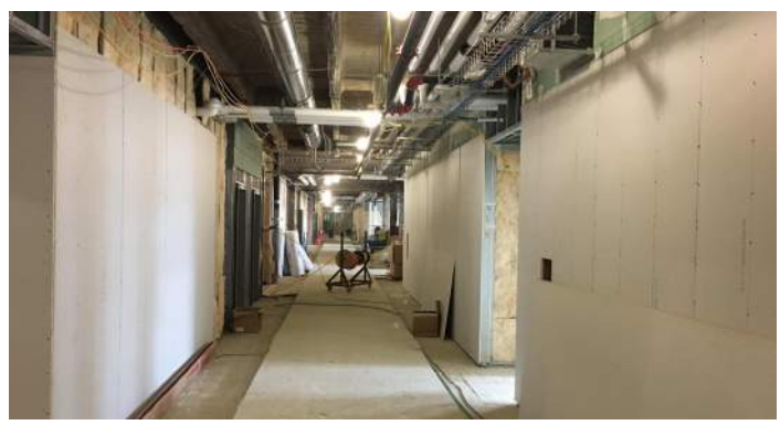
Area G 3rd Floor Corridor