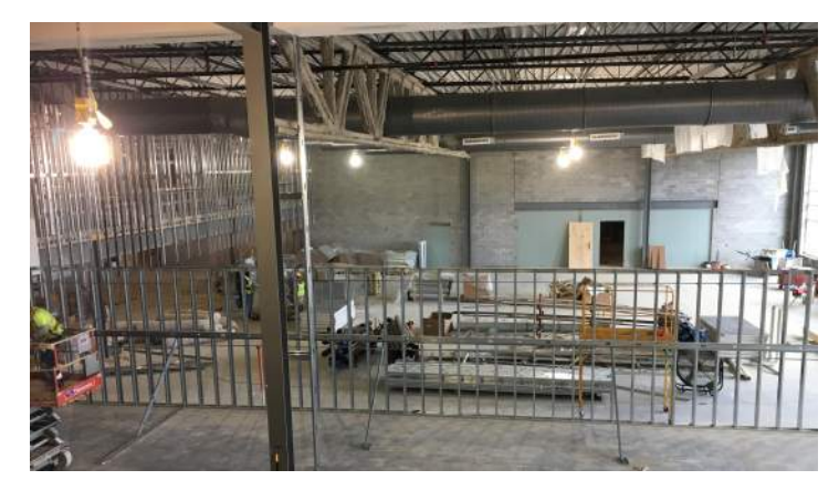
Area E Reading Area & Dining Commons