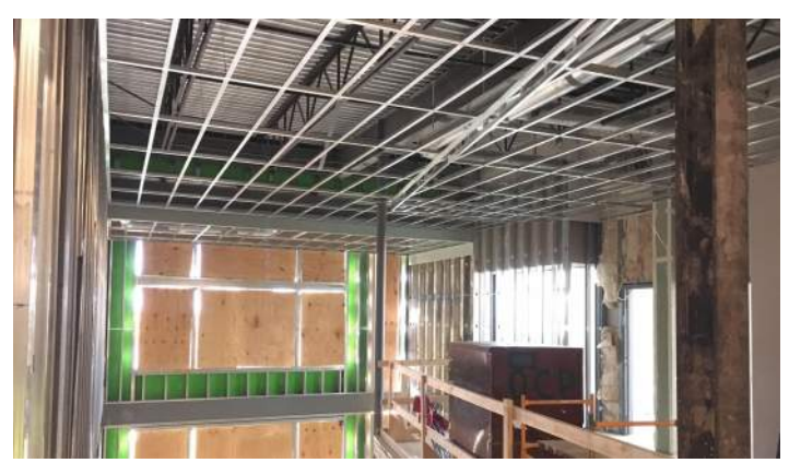
Area A Atrium Ceiling Framing