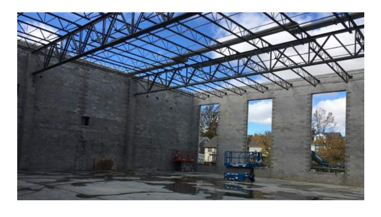
Auxiliary Gym Area C Washington Level