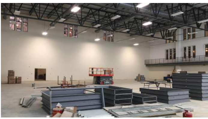
Competition Gym Area B Washington Level