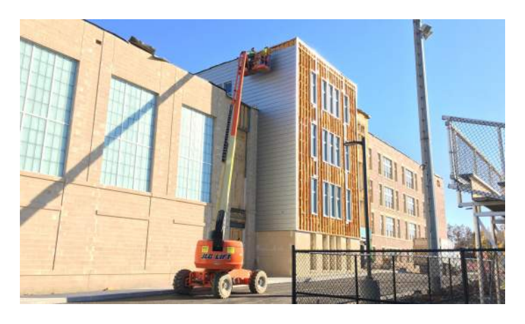
Metal Panel Veneer on Area A North Elevation