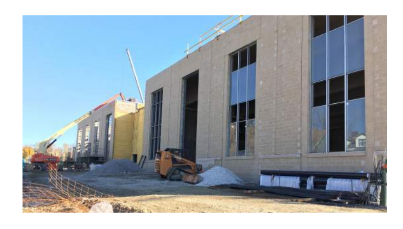
Cast Stone Veneer on Area C North Elevation