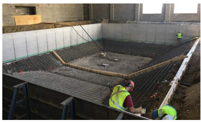
Prep for Pool Concrete Floor in Area C Washington Level