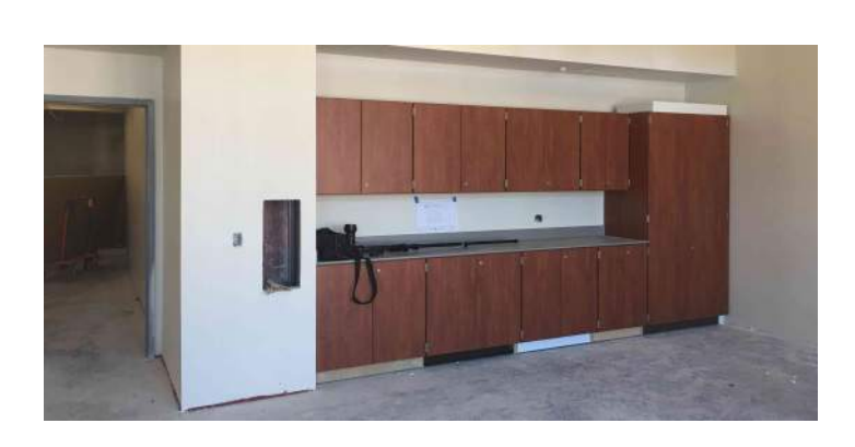
Casework Installation in Area A 3rd Floor