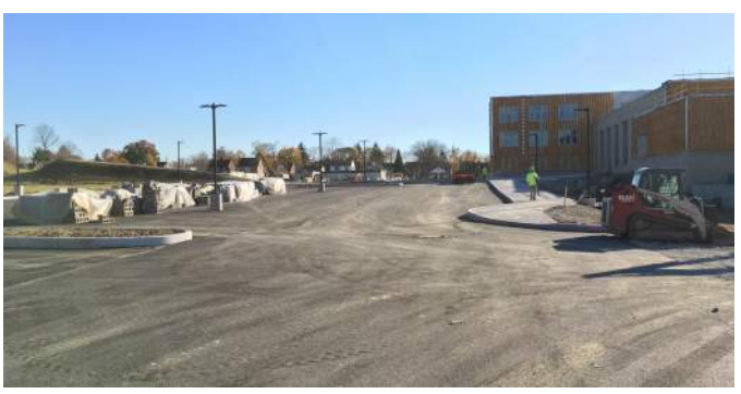
Asphalt Paving Intermediate Course on East Road