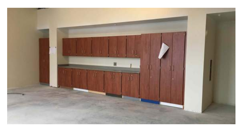
Area A 3rd Floor Casework Installation