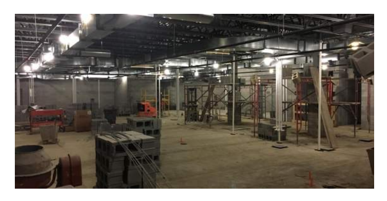
Area D Cedar Level MEP Rough-In