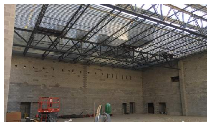
Area C Washington Level Auxiliary Gym Metal Roof Decking