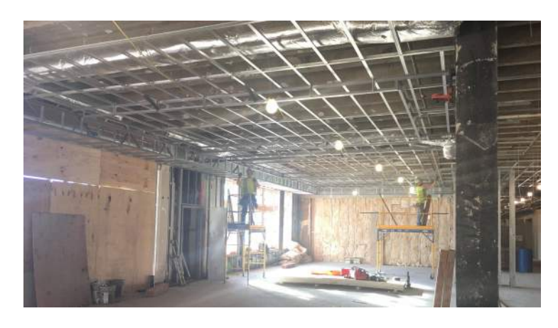
Area G 3rd Floor Vaulted Ceiling Framing