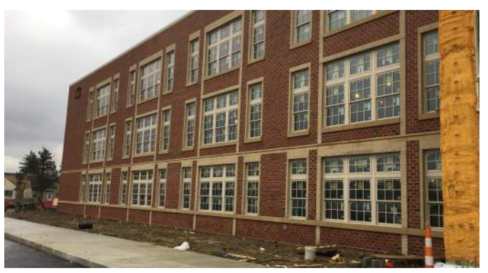
Area F East Elevation Masonry Cleaning