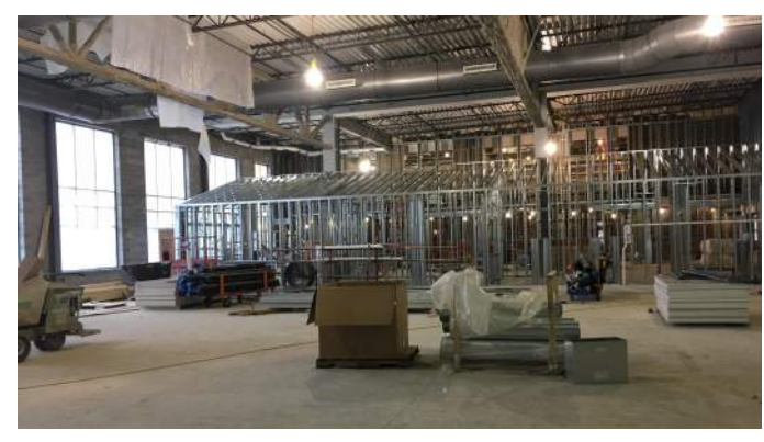
Area E Cedar Level Metal Stud Framing