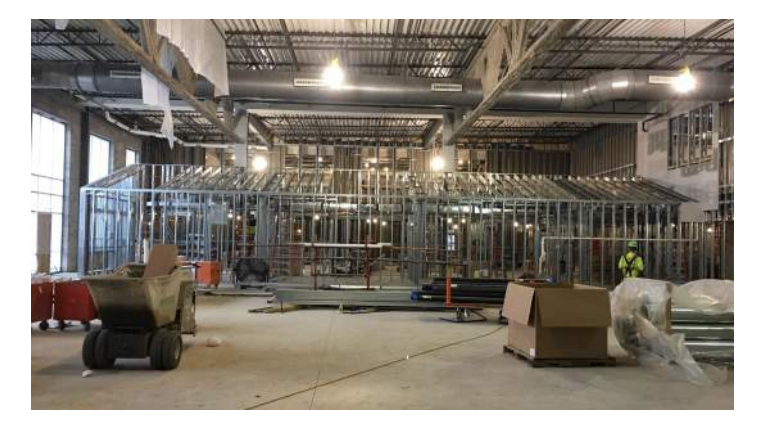
Area F Cedar Level Framing & MEP Installation