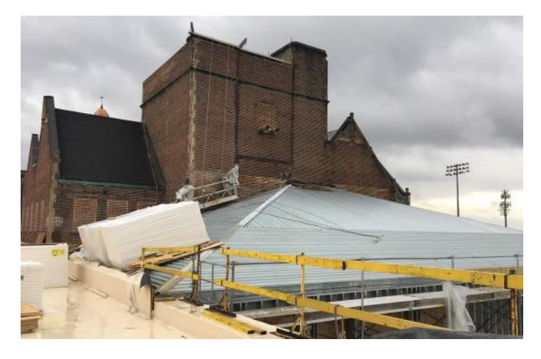
Area C Gable Roof Installation