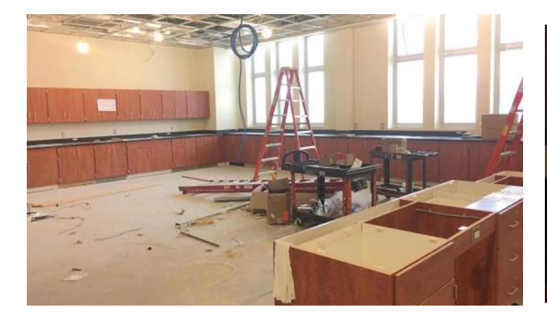
Area A 3rd Floor Casework Installation