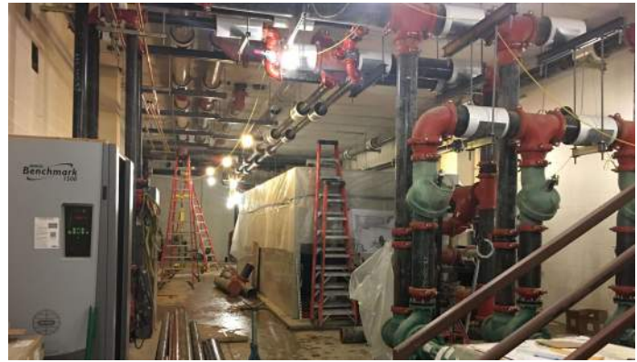
Area C Washington Level Mechanical Room C032