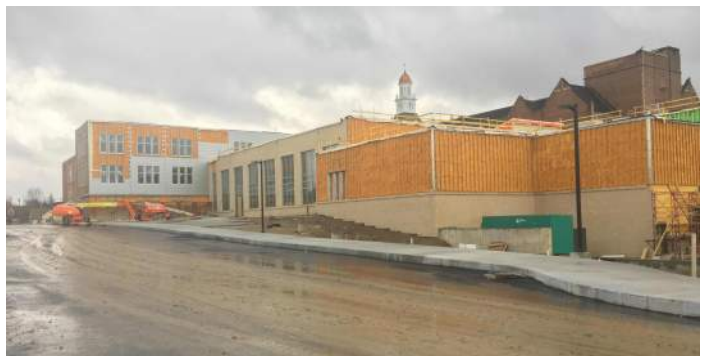
Area D, E & F East & North Elevation