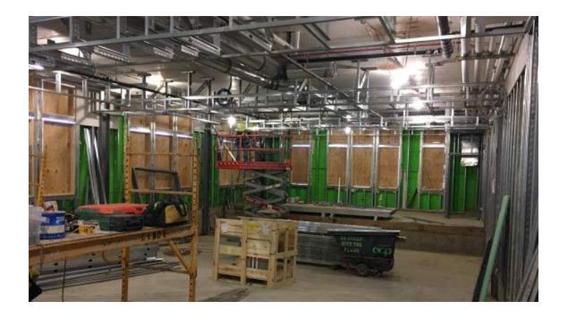
Area F Cedar Level Mini Auditorium Framing