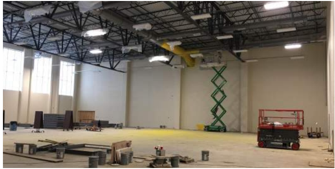
Competition Gym Spiral Duct Painting