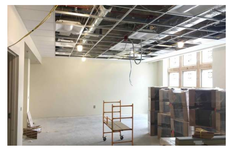
Area A 2nd Floor Ceiling, Lights, Speaker & Sprinkler Installation