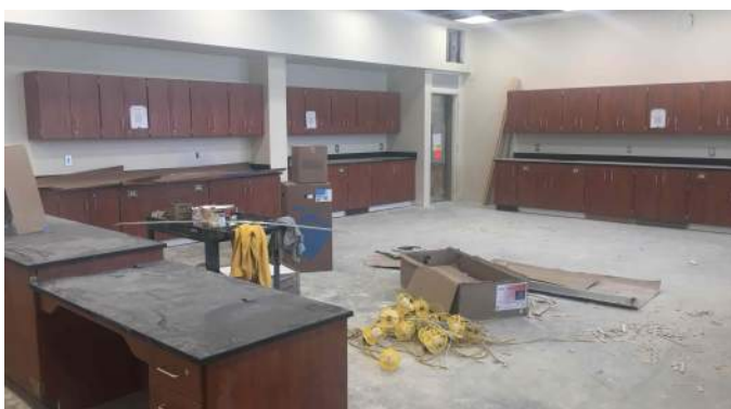
Area A 3rd Floor Casework Installation