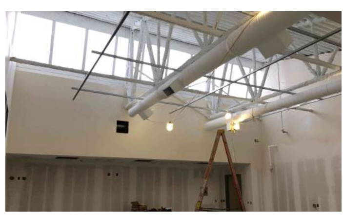
Science Classroom Duct & Ceiling Painting Area E 2nd Floor