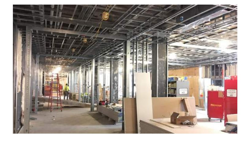
Ceiling & Wall Framing Installation Area G 3rd Floor