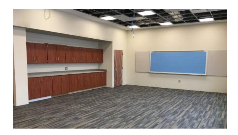
Carpet Tile Installation Area A 3rd Floor