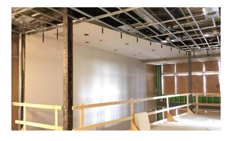
Gypsum Board Installation Area A 3rd Floor