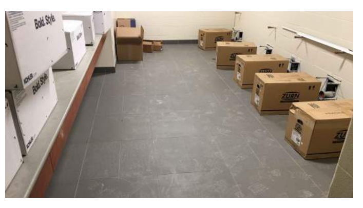
Porcelain Tile Installation Area A 3rd Floor