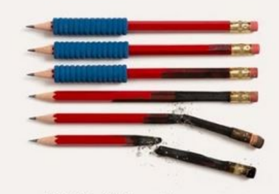
Public Education and the Assault on American Democracy