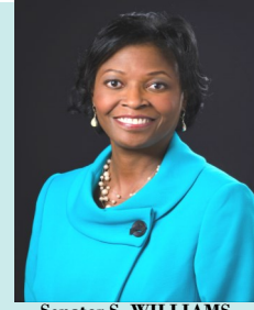
Senator S. WILLIAMS