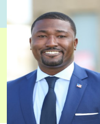
Rep. T. UPCHURCH