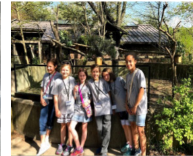
Some of us took a picture in front of the koalas.