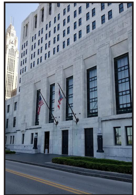
The Supreme Court of Ohio.

During the trip we visited the Supreme Court of Ohio. We arrived by charter bus and immediately went inside the building, where we were greeted by our knowledgeable tour guides. We were very fortunate to see the Supreme Court in session. The Chief Justice sat in the center and was flanked by 3 associate justices on either side. The argument before the court was concerning whether someone needed a license to mine natural gas. It was very cool to see the lawyers presenting their evidence before the court. Then, we went to the Supreme Court Law Library, where we had very good views of the Scioto River and COSI. Everyone thought the Law Library was amazing because of the collection of nearly 2,000 volumes of law books that were originally a part of the State Library Collection. Afterward, we journeyed to the reading room, where we discussed more about the three branches of government. We left the reading room and returned to the courtroom. One of the groups had an opportunity to participate in a mock trial of Harry Potter. Visiting the Supreme Court of Ohio was a very fun and interesting experience in which we also learned a lot of important facts and history surrounding our state judicial system.