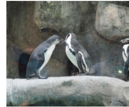
These penguins think that it is high time for a taste snack.