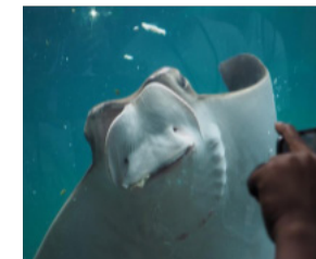
Did you ever expect that a sting ray looked like this?