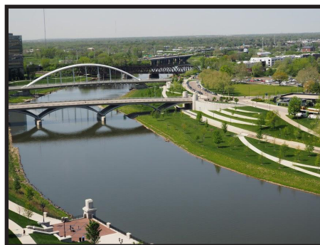
Views of COSI and the Scioto River from the Law Library of the Supreme Court of Ohio.