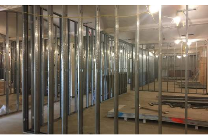
Metal Stud Framing on Vocal Level