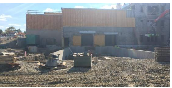
Emergency Generator & Retaining Walls Area D Service Area