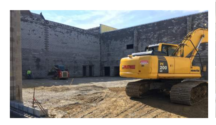
Grading in Area C Auxiliary Gym