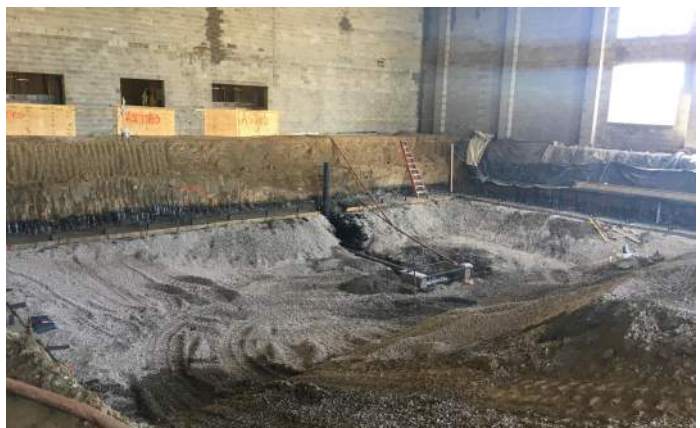
Area C Washington Level Pool Excavation