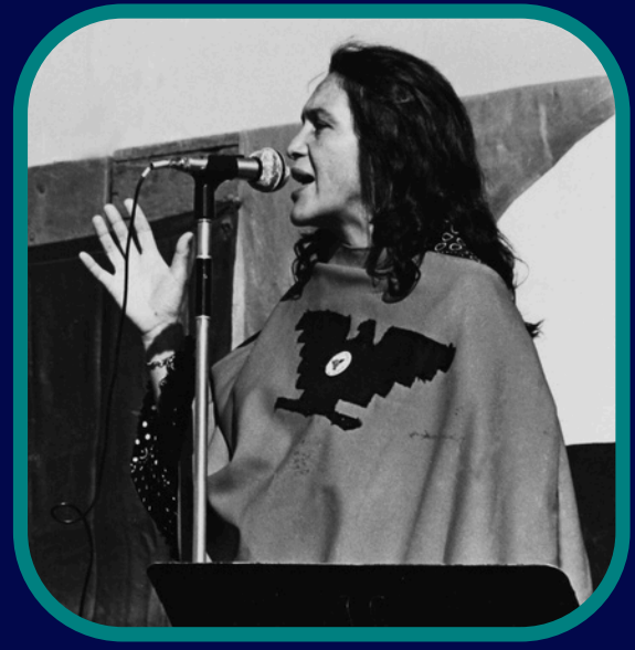
DOLORES HUERTA (1930 - Present)

“EVERY MOMENT IS AN ORGANIZING OPPORTUNITY, EVERY PERSON A POTENTIAL ACTIVIST, EVERY MINUTE A CHANCE TO CHANGE THE WORLD.”