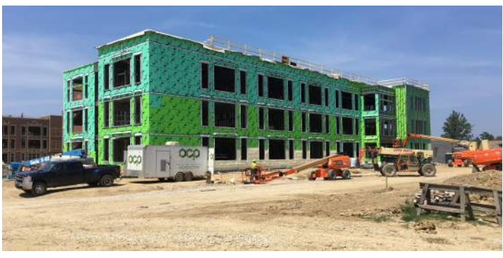
Area F Spray Foam & Masonry Veneer