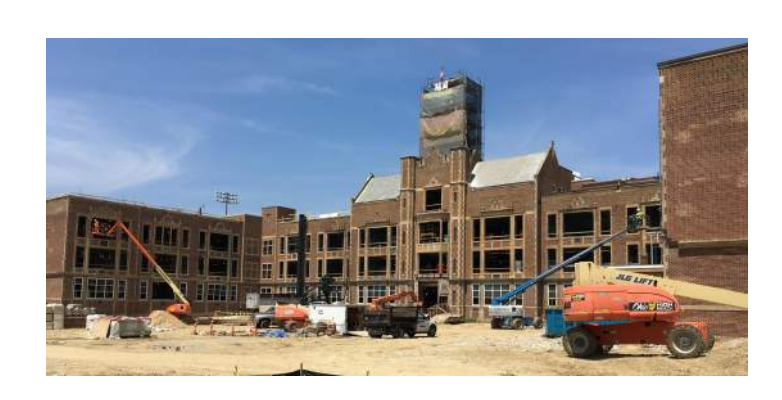
Courtyard Existing Window Demo