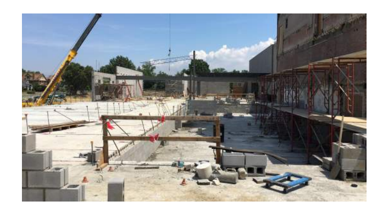
Area C Cedar Level Hollow Core