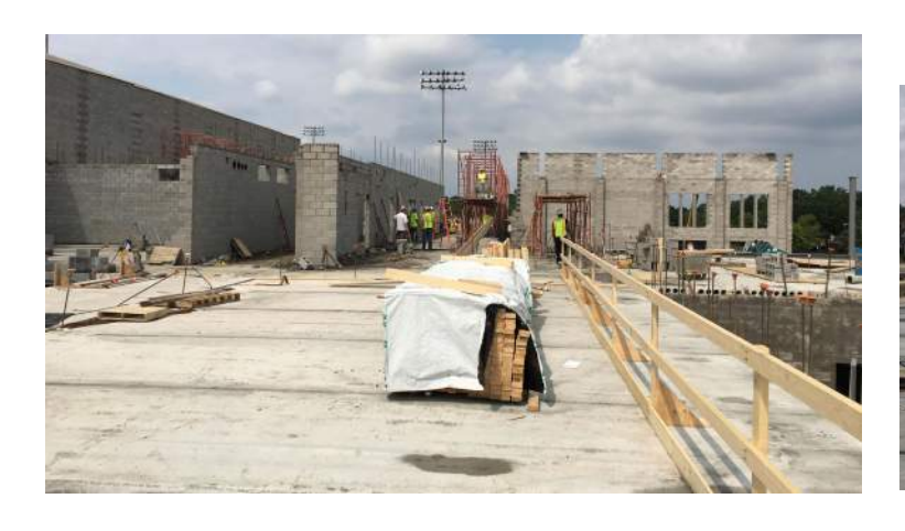
Area C Cedar Level Interior Masonry