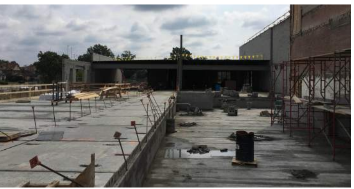
Area D Roof Decking