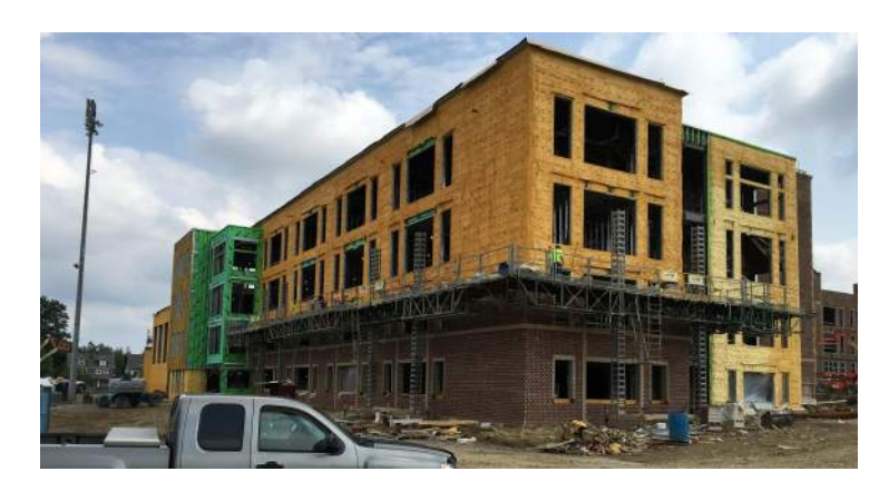
Area A West & South Elevation Brick Veneer