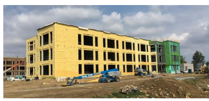
Area F West Elevation Spray Foam