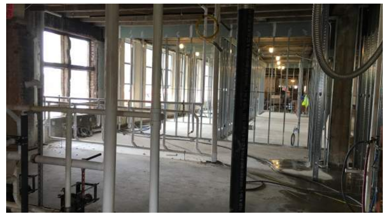
Area F Cedar Level Plumbing & Framing