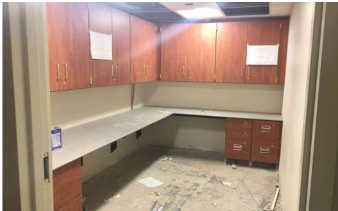
Casework Installation on 4th Floor Area G