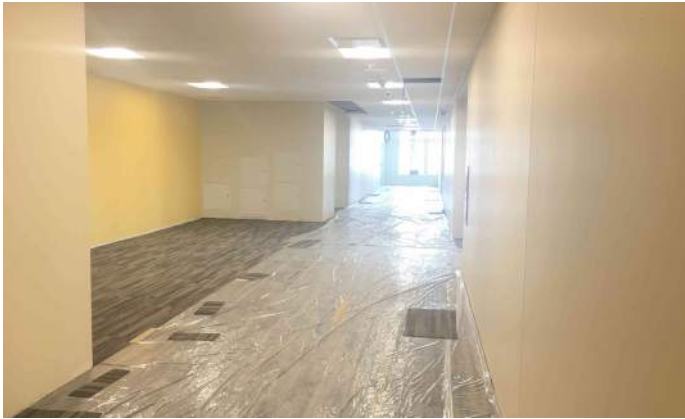
Carpet Installation in 2nd Floor Area A Corridor