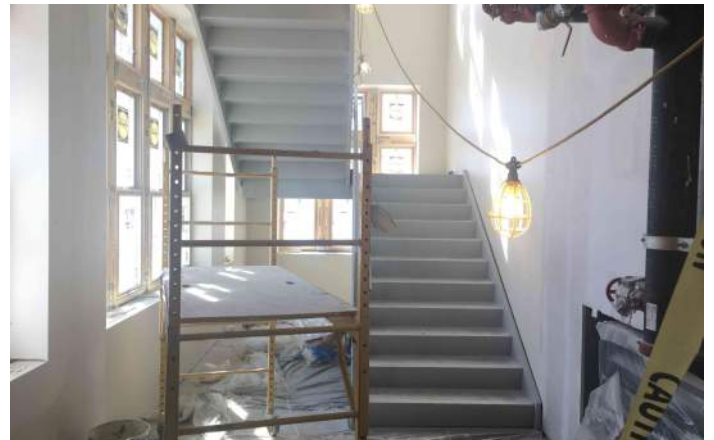
Metal Stair Painting Area F South Stair