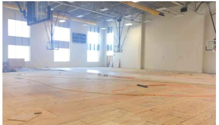
Wood Flooring Installation in Auxiliary Gym