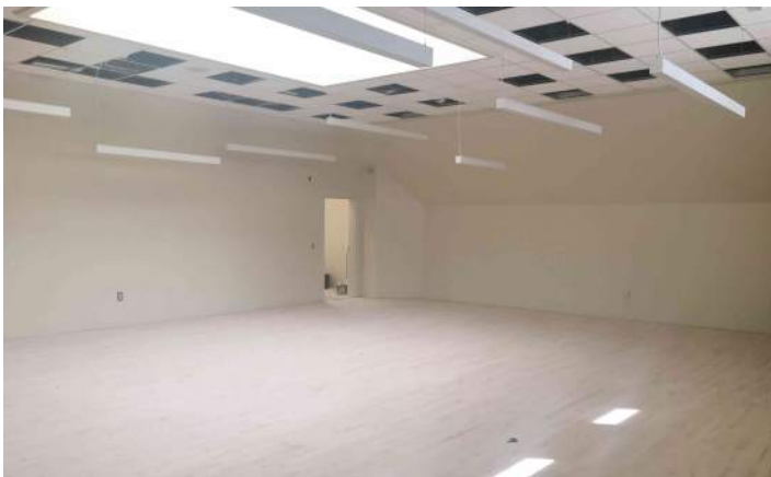
Wood Flooring Installation on 4th Floor Area G