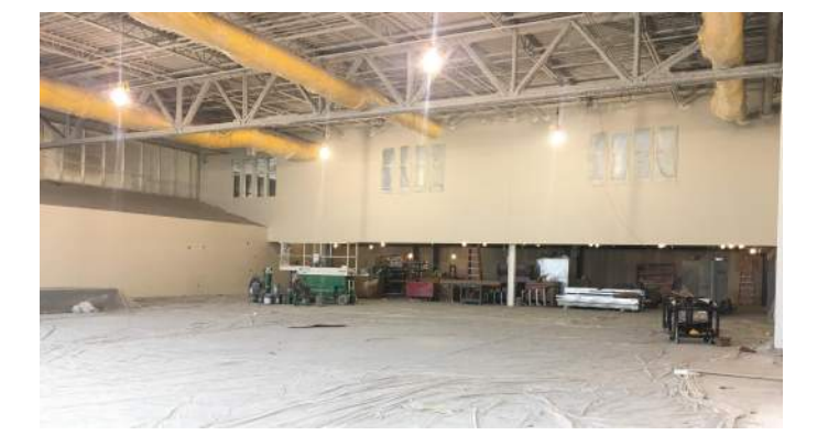
Painting Ceiling in Area E Dining Commons