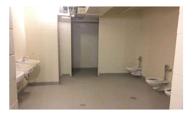
Mosaic Tile Installation Area A Washington Level

Finish Flooring Installation on Area G 3.5 Level