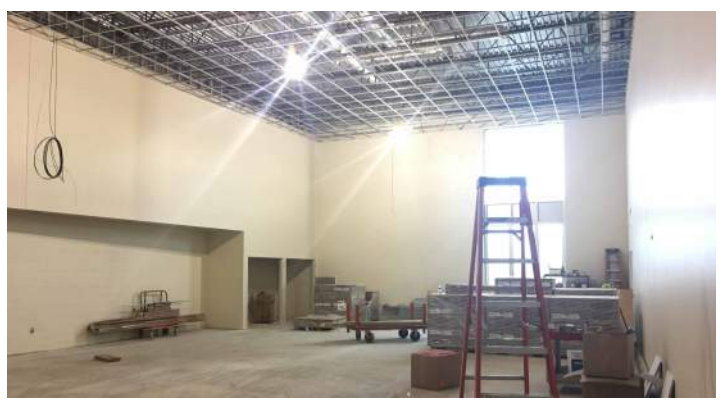
Acoustical Tile Ceiling Installation Area C Cedar Level