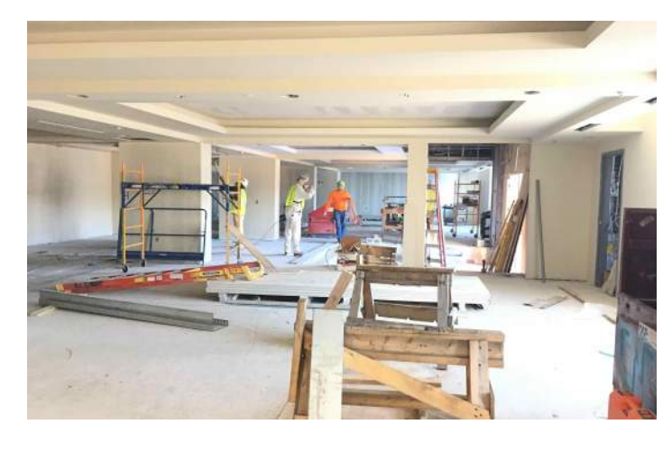
Painting in Area G Cedar Level Lobby