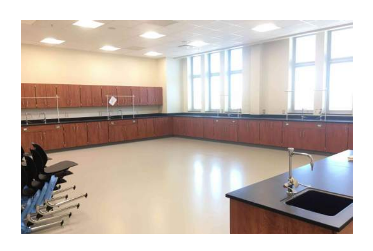
Floor Coating Installation in Area A 3rd Floor