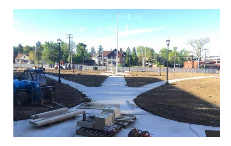
Courtyard Sidewalks & Flag Pole Installation