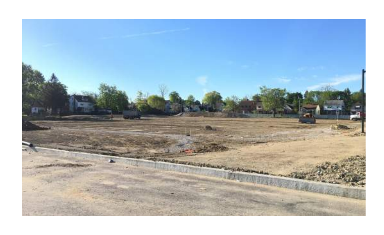
Baseball Field Grading & Underdrain Installation