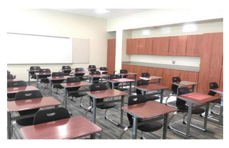
Classroom Furniture Installation in Area A 3rd Floor