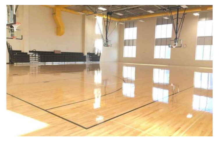
Wood Floor Finishing in Auxiliary Gym