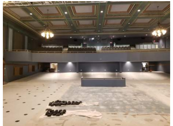
Painting Walls in the Auditorium