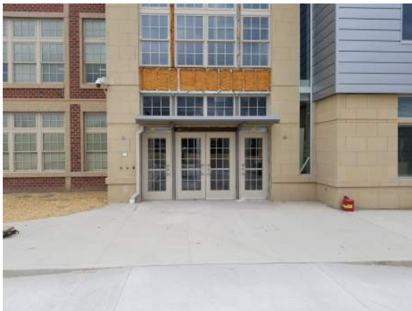
Exterior Doors in Area F East