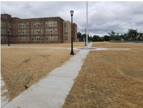
Laying Straw in the Courtyard