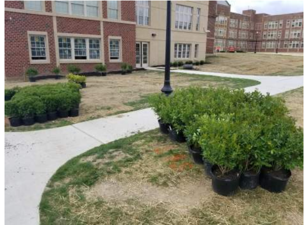
Shrubs to be Planted in the Courtyard