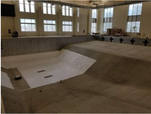
Painting the Pool Floor