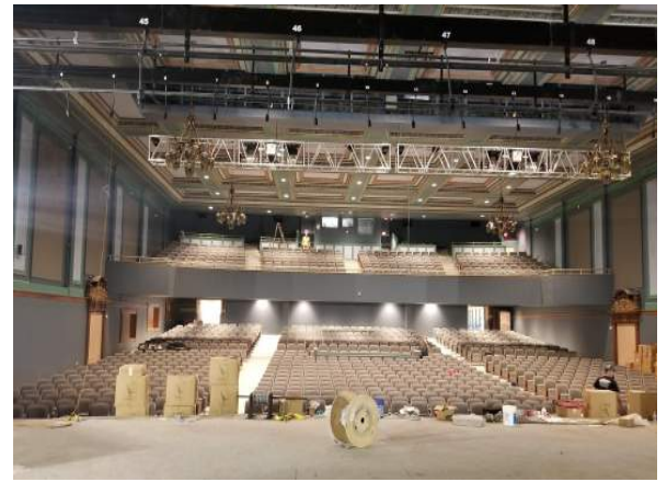
Auditorium Seating Installation