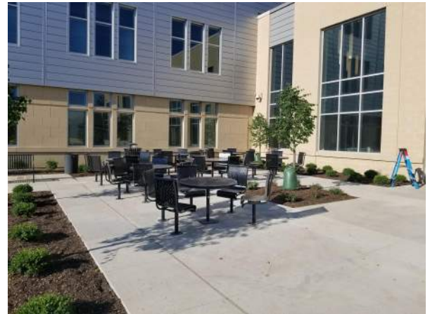
Furniture in the Outdoor Plaza