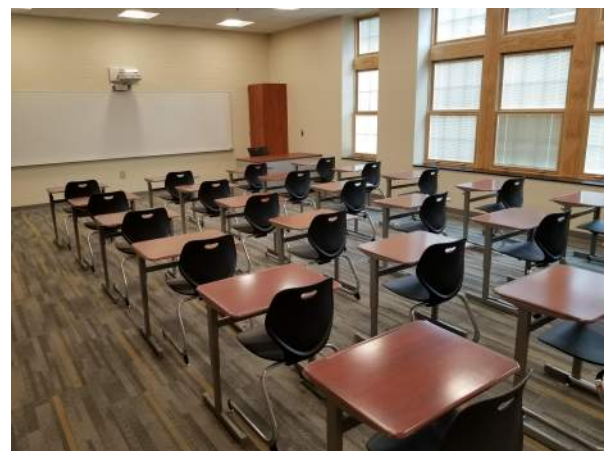
Furniture Installation in Area F 2nd & 3rd Floors