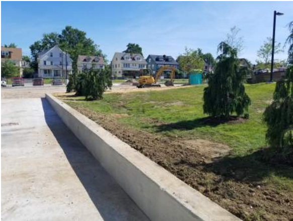
Site Landscaping Installation