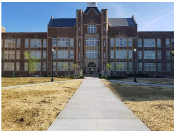
Courtyard Exterior Door Installation