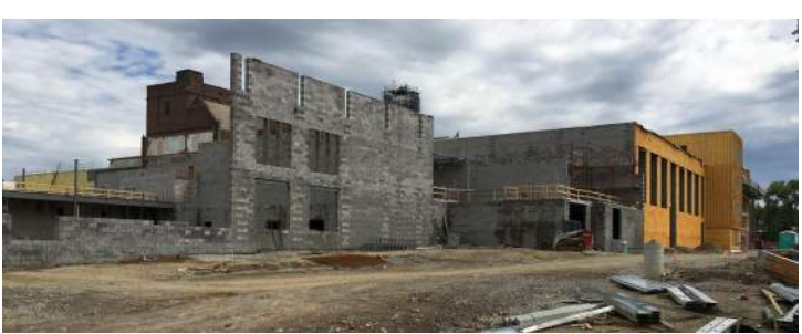
Area B Spray Foam & Area C Masonry