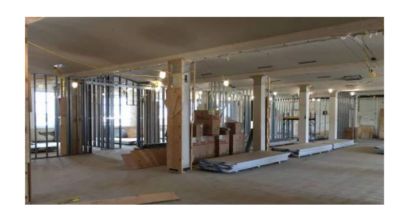
Area G Art Level Interior Metal Stud Framing