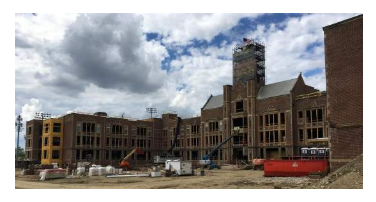
Courtyard Wood Window Replacement