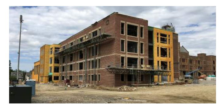
Area A Brick Veneer