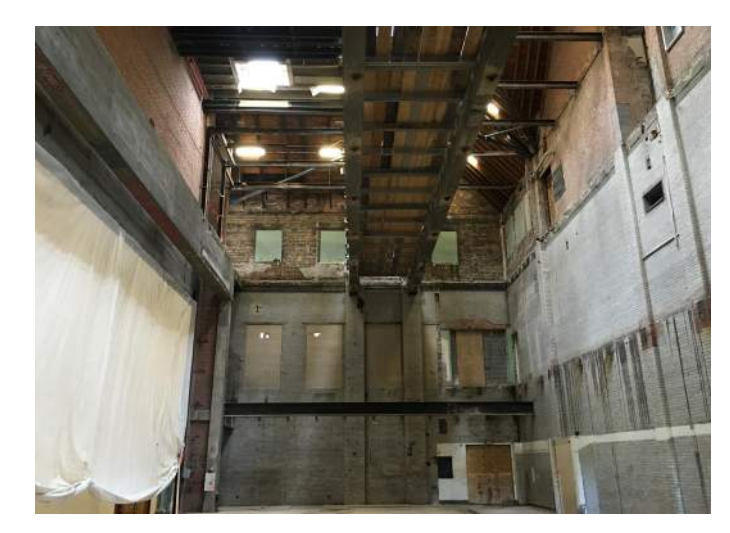
Area G Auditorium Structural Steel Demo Complete