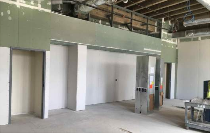
Area A 3rd Floor Classroom Drywall Installation