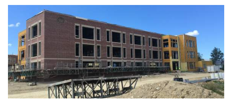
Area F Brick Veneer