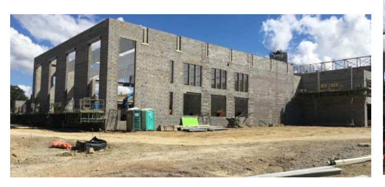
Area C Natatorium Exterior Masonry