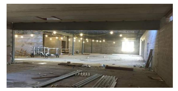
Cedar Level Area D Kitchen