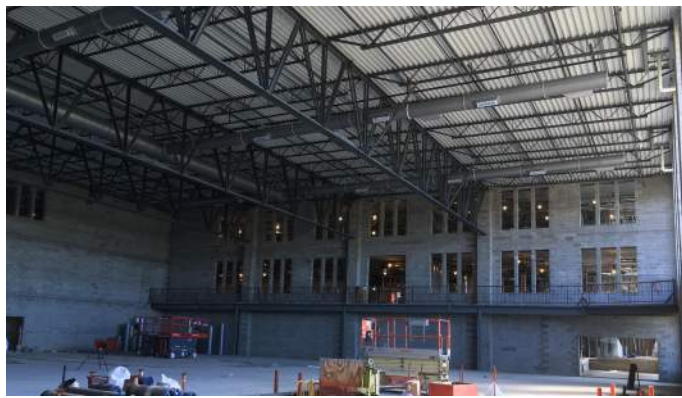
Washington Level Area B Competition Gym