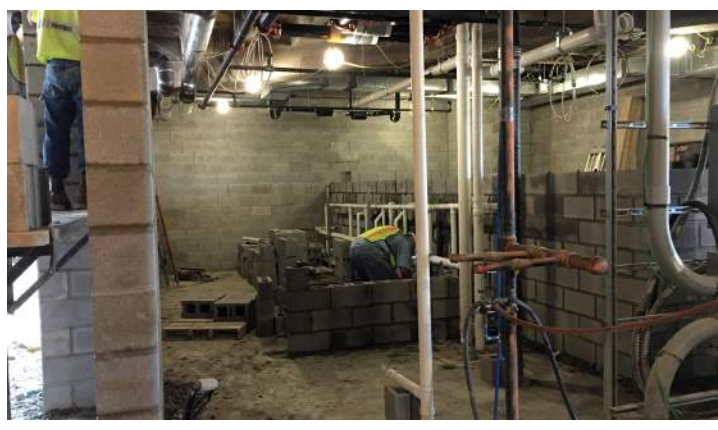
Bathroom Masonry Area A Cedar Level