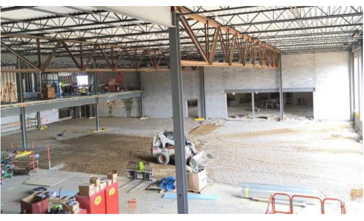
Prep Dining Commons for Slab-On-Grade