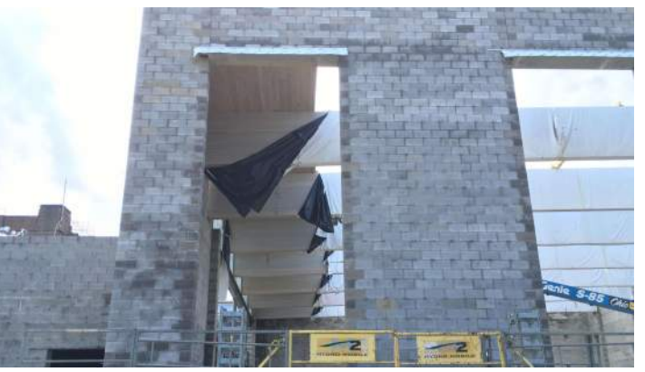
Wood Roof Decking at Pool