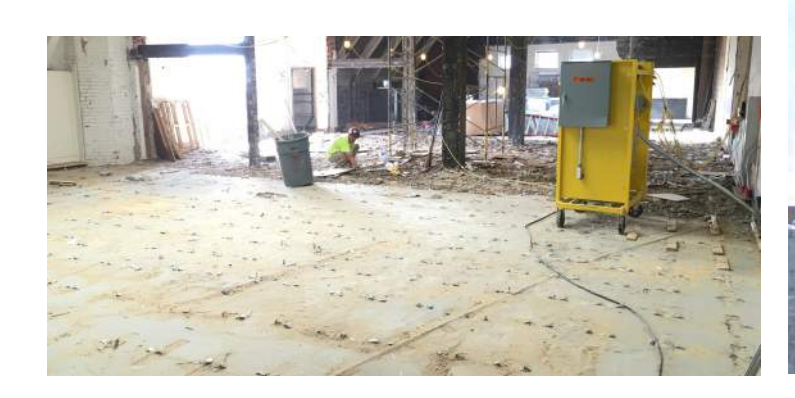
Demo of Existing Wood Flooring on 4th Floor Vocal Level