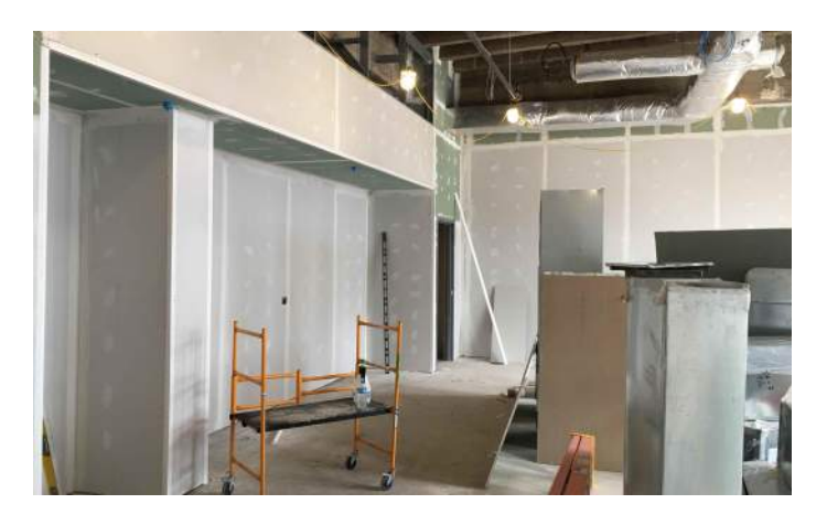
Drywall finishing Area A 3rd Floor