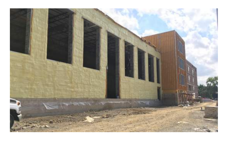
Cast Stone Veneer Area B West Elevation