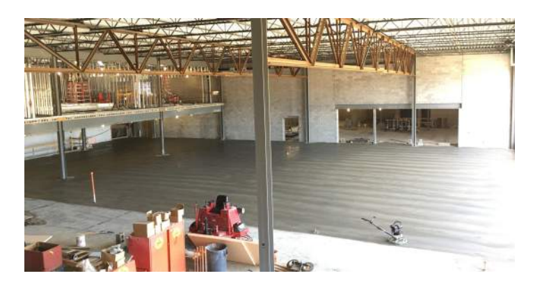
Area E Dining Commons Slab-On-Grade