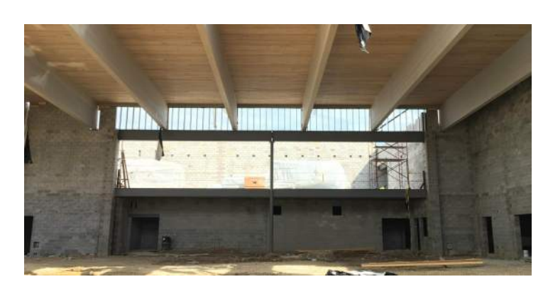
Natatorium Wood Roof Decking