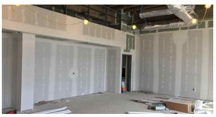
Area G 3rd Floor Drywall Finishing