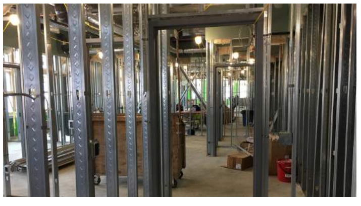
Area F Cedar Level Metal Stud Framing