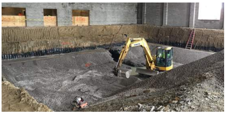
Area C Washington Level Pool Excavation