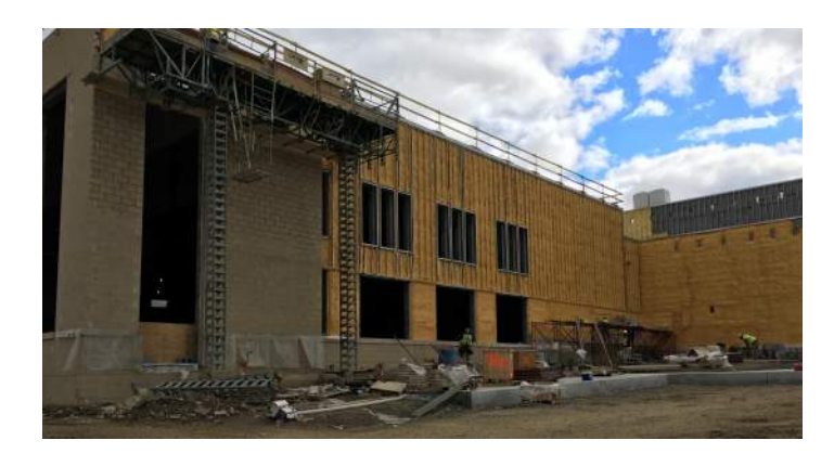
Area C Exterior Masonry Veneer