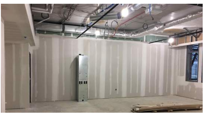
Area A 2nd Floor Drywall Finishing