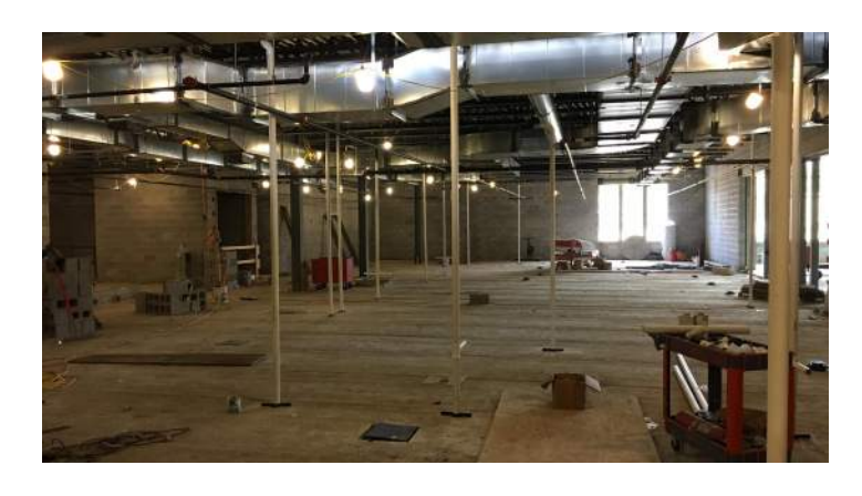
Area D Washington Level Kitchen MEP Prep